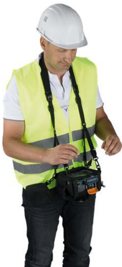
Hands-free FiberXpert strap